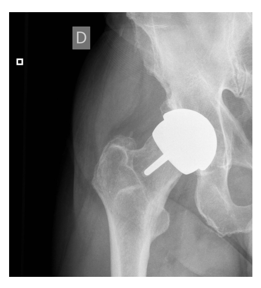
Figure 1 MoM hip arthroplasty implanted 13 years previously. Normal blood metal levels. Asymptomatic patient.

an informed consent document prepared specifically for this study.