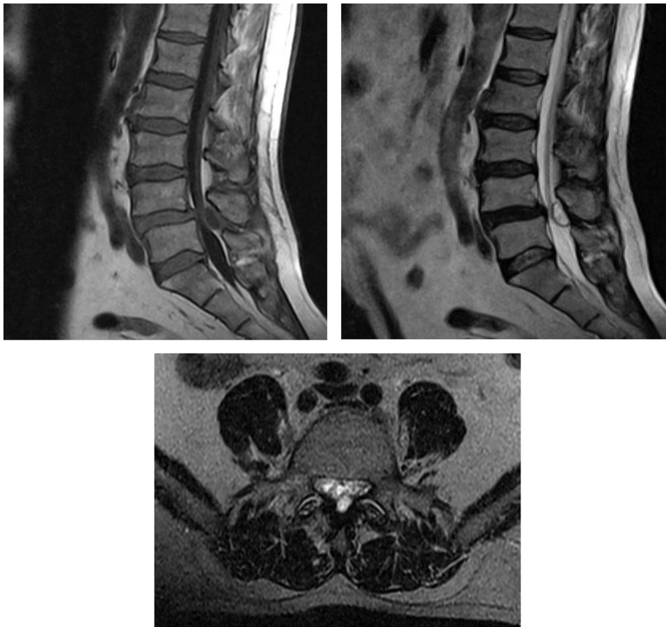
Figure 2 T1 sagittal (isointense), and T2 sagittal and axial (hypertense, haematic material) of left LSC L4–L5 (case 8).

When these cysts do not respond to conservative treatment, there is great controversy regarding the best surgical approach. A surgical approach may range from simple excision of the synovial cyst with hemi or laminectomy, to minimally invasive techniques or even synovial cyst removal with associated instrumentation.