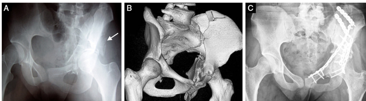
Figure 2 (A) Both-column fracture in a 22-year-old female. The arrow points to the “spur sign” indicating the most distal part of the iliac wing that is still attached to the sacrum. (B) 3D reconstructions afford us an overall view of the injury. (C) Post-operative control at 36 months. Anatomical reduction. Mild osteoarthritis of the hip.

The mean time elapsed between injury and surgery was 11 days (range: 5–31). In only 5 cases (22%), the surgery was delayed more than 2 weeks because of either severe multiple traumas involving a lengthy stay in Intensive Care or the patient being transferred from another hospital.