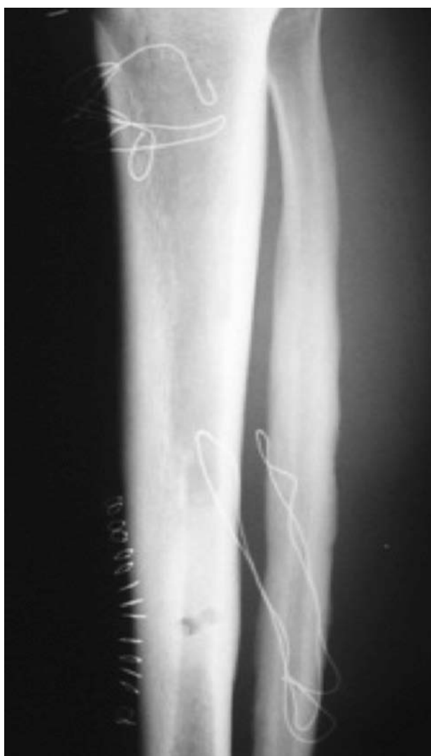
Figure 2. X-ray follow-up after reaming the intramedullary canal of the affected tibia.

fects the skull, mandible, vertebrae and upper limbs and pathological tests show bone resorption).