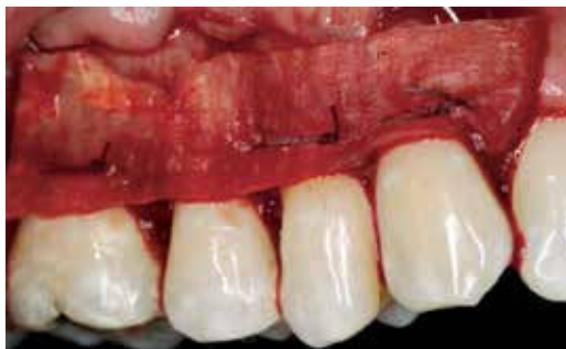
Figure 7. Fascia lata placed and fixated on receptor site with absorbable suture points.

Twelve months later, a strong bond can be observed between collagen fibers of the receptor's site connective tissue and fascia lata graft. These fibers