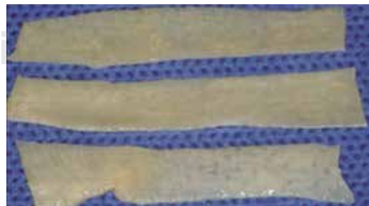
Figure 5. Fascia lata hydrating in physiological serum in a metallic band.