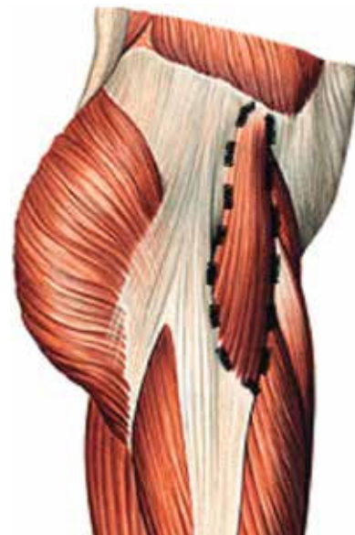
Figure 2. Fascia lata tensor muscle. 12

Fascia lata allograft provided by a corpse is a resorbable and biocompatible material ( Figure 2 ) well tolerated by the receptor bed. 10 Moreover, this type of allograft prevents tissue invagination since it acts by prevening evolution of cells with different characteristics. 11 It possesses reconstructive ability, allowing graft re-