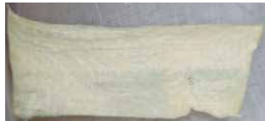
Figure 4. A) Fascia lata within package. B) Fascia lata out of package.