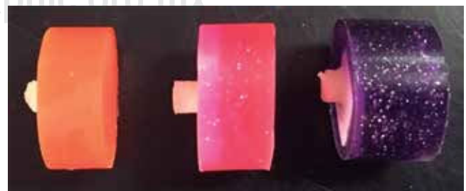
Figure 3. Samples of all three resin cements.

Ketac Cem (3M™ ESPE™) glass ionomer samples were discarded, since during manufacturing, all 10 samples failed ( Figure 5 ).