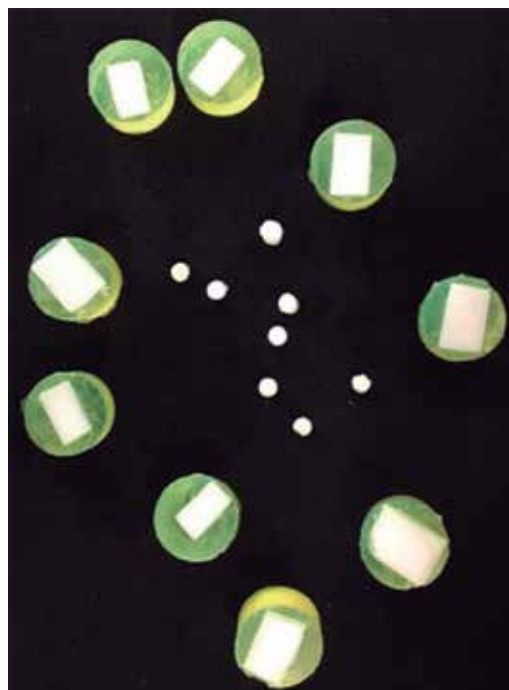
Figure 5. Ketac Cem, 3M™ ESPE™ glass ionomer.

Bonding agents have been developed in recent years. They have been introduced to improve bonding strength of ceramic to zirconium. When using RelyX® Elite and Multilink® Automix, the manufacturer recommends, in an alternative manner, to use systems with imprinters or bonding agent Single