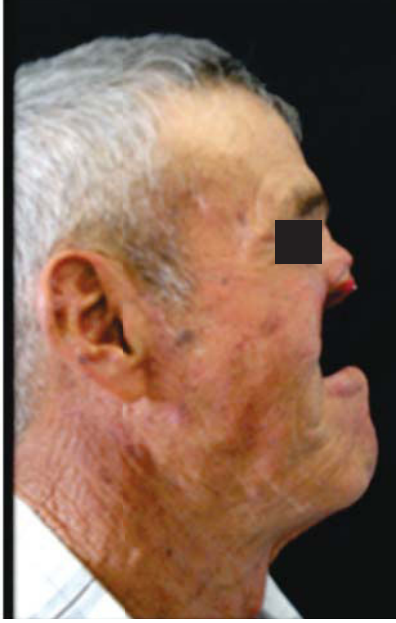
Figure 1. Initial photographs.