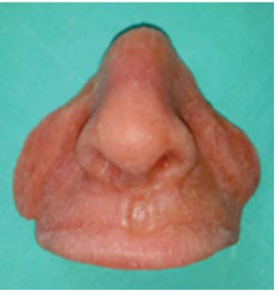
Figure 3. Obturator and facial model pattern.