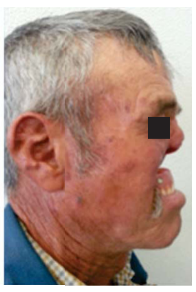
Figure 4. Obturator in place.