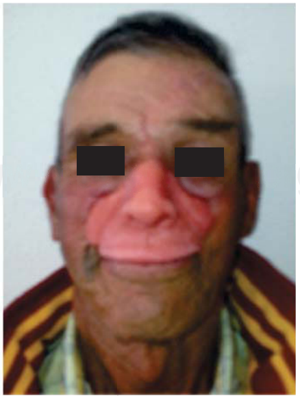
Figure 5. Facial structure test.