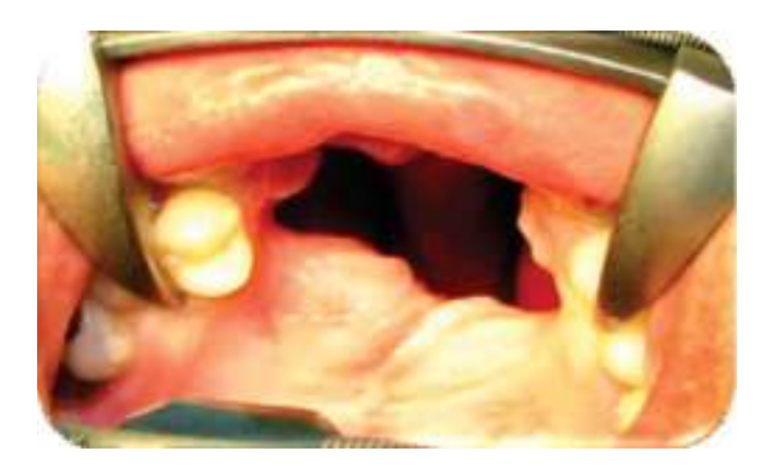
Figure 1. Initial intra-oral photograph. Anterior palatal fistula measuring 2.5 \times 2.5 cm.

borders were dissected and everted and then sutured with 910 4-0 polyglactine, 100% closure was achieved in the nasal mucosa plane. Nasal irrigation was undertaken with physiological solution, no egress of liquid was observed from the sutured defect. The Digman type mouth prop was removed and a Mackinson mouth opener was placed. The tongue was pulled with one 2-0 silk suture point at the tongue's tip. The anterior-based tongue flap was designed so as to be of a size 20% larger than the defect and with an approximate length of 5 cm, taking great care to cover the whole defect and avoid tension. Hemostasis was achieved with electrocautery and with polyglactin 910 sutures. Suturing of donor site was executed in two planes with 4-0 polyglactin 910;