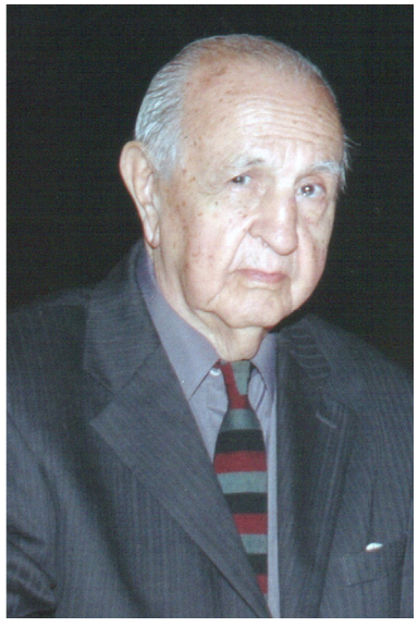
Social event, circa 2006