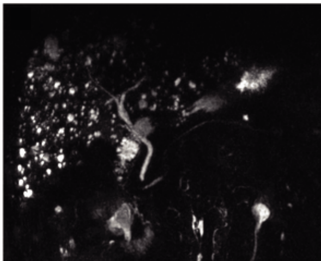
Figure 3. MRCP shows no communication of the lesions with the biliary duct.