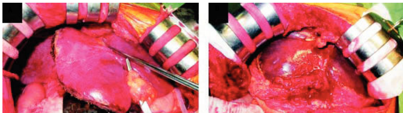
Figure 1. Intraoperative findings of the first and the second sessions of surgery. A. The graft in situ after transplantation (in the initial operation). B. During re-exploration, congestion of the liver graft after torsion of the left hepatic vein was noted (the intraoperative echogram revealed the patient's blood flow of the hepatic artery and the portal vein.).

To minimize the progression of such complications of hepatic venous outflow, early detection is important. 1,3 Early correction is the key survival determinant of both the graft and the patient. A high suspicion of vascular problem is mandatory when an unusual manifestation of symptoms or signs or laboratory data was found. To detect the torsion earlier, Doppler ultrasound could be applied to investigate hepatic venous flow of liver grafts. 1,3,8 However, some immediate postoperative artifacts may interfere with the ultrasound interpretation. The imaging diagnosis of the graft congestion in our patient was established by the liver triphase CT, as Park's suggestion. 7 Some authors recommended using magnetic resonance