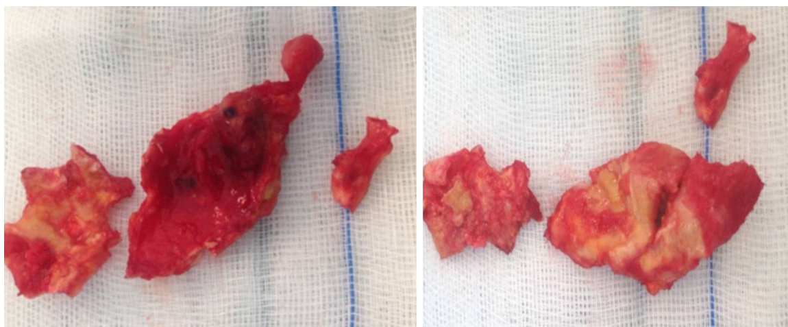
Figure 4 Gross appearance of some of the aneurysm wall fragments sent to histopathological analysis, infiltration of the aneurysm wall by the inflammatory mass is visible.

place. The histological analysis of the samples revealed aspects compatible with tuberculosis (acid and alcohol-fast bacilli were not identified), the patient was referred to the Pneumologic Diagnostic Center and is at the moment under tuberculostatic therapy, doing well at eight months follow-up.