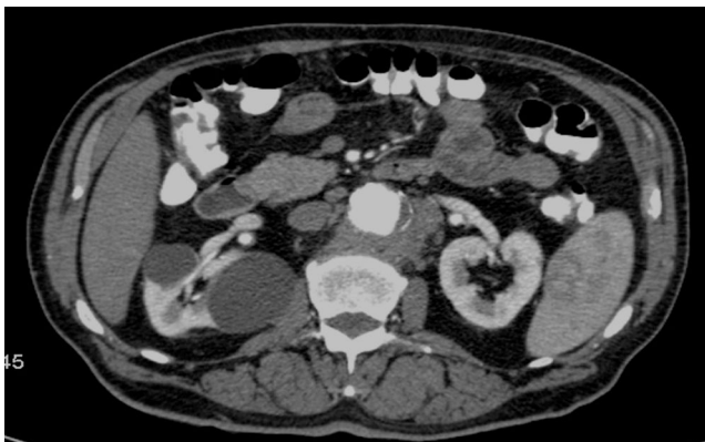
Figure 1 Pre-operative CT scan showing an inflammatory mass surrounding the aneurysm and enclosing the left renal artery's ostium.

A 73 year old male, with smoking habits, ischemic cardiopathy and hypertension, was the subject of regular imagiologic surveillance due to a 4cm pararenal abdominal aortic aneurysm. He was taken to the emergency department after routine CT examination for suspected contained aneurysm rupture. The Angio-CT was repeated and an inflammatory mass surrounding the aneurysm was identified, which enclosed the left renal artery ostium, without any signs of rupture (Fig. 1). This inflammatory mass was not described in the previous CT scans the patient had been submitted to. The patient denied previous Tuberculosis infection as well as having had fever, shivers or abdominal pain prior to admittance, referring a 10 kg weight loss during the previous year. The laboratory analysis did not present any relevant changes or increased inflammatory parameters and the blood cultures and serologies were negative. He was submitted to elective surgery. Under supra-renal clamping the aneurysm was partially resected and, using a bifurcated Dacron graft, an aorto-bifemoral interposition and a bypass to the left renal artery done (Fig. 2). The aneurysm's intraoperative appearance was that of an inflammatory aneurysm (Fig. 3), no abscess or fluid collection was