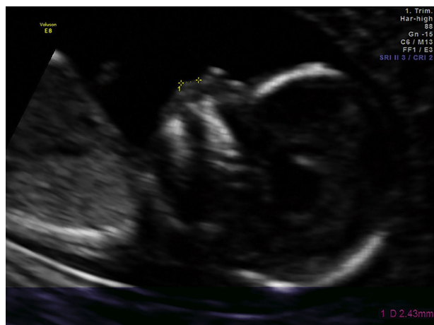
Fig. 1 – Sonographic measurement of the philtrum length at 13 weeks of gestation.

The fetal philtrum assessment was made only once during pregnancy in a routine ultrasound evaluation after written informed consent. For all examinations the mid-sagittal plane was obtained only by a single operator. The FPL was measured with electronic callipers from the posterior border of the columella to the top of the upper lip, as described by a previous study 12 (Fig. 1).