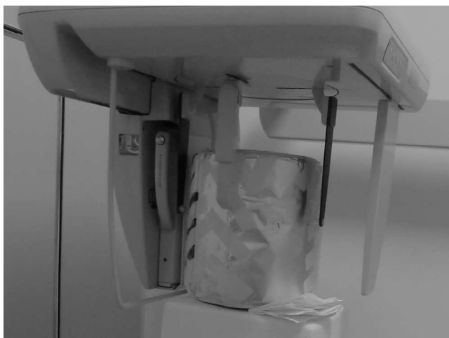
Fig. 1 – The picture shows a skull stabilized in the cephalostat on an aluminum filter cylinder.

sample of convenience was selected according to the following inclusion criteria: reproducible occlusion, presence of permanent upper and lower incisors, and presence of at least one molar on either side to maintain the vertical dimension. The mandibles were stably connected to the maxilla through occlusal interdigitation at the maximum occlusion, with the condyles located in the glenoid fossa. The mandibles were attached to the skulls with broad tape attached from the temporal bone of one side, crossing the inferior border of the mandible, to the temporal bone of the opposite side.