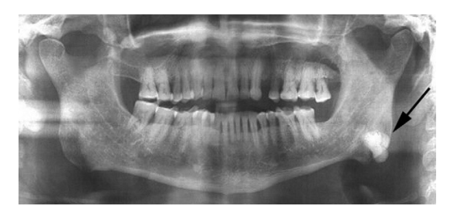
Fig. 1 – Dental panoramic tomography showing a radiopaque well-defined image at the left mandibular angle.

A Computed Tomography was performed with a HiSpeed NX-I Dual Slice (General Electrics Dentascan, General Electrics Healthcare, United Kingdom; Dentascan). Axial slices