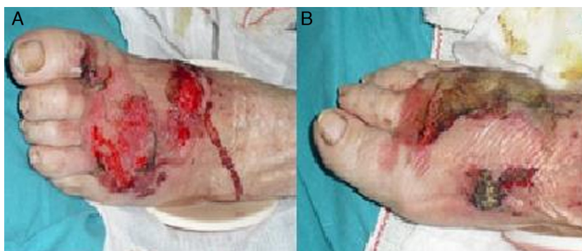
Fig. 1. Photograph of the anterior surface of the left (A) and right (B) feet showing ulcerous lesions.

Based on the difficulty to identify Fusarium at a species level, the isolate was sent to the Medical Mycology laboratory (Faculty of Medicine) where it was subcultured on Potato Dextrose Agar, Corn Meal Agar and Malt Extract Agar. Macroscopic and microscopic features were exhaustively studied and concluded in the identification of the strain as F. dimerum (Fig. 3). For molecular identification, ITS1-ITS4 and the 5.8S region of the rDNA were amplified with specific primers in a semi-nested PCR. 4 The sequence of a