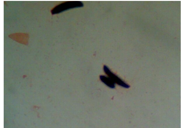
Fig. 2. Direct microscopic observation of the right foot sample. Gram stain (1000 \times ).

Physical examination revealed a bad general status and hemodynamic compromise with BP 65/38 mmHg. The cardio-pulmonary examination showed low rhythmic tones and bilateral basal crackles. Laboratory investigations revealed signals of renal failure (creatinine: 8.73 mg/dl; glomerular filtration rate: 5 ml/min), metabolic acidosis (pH: 7.26, HCO 3 : 16.2 mequiv./L), light thrombocytopenia ( 122 \times 10^3/\mu\text{L} ), leukocytosis ( 37 \times 10^3/\mu\text{L} ) and anemia (Hb: 7.6 mg/dl; VCM: 115.6 fl). Transaminase enzymes and coagulation were normal. After these findings, a subsequent study of bone marrow and peripheral blood resulted in the diagnosis of acute myeloblastic leukemia (AML). Hemodynamic support measures and intravenous treatment with antibiotic were established considering the renal function. Piperaziline–tazobactam 2 g/8 h and levofloxacin 250 mg/48 h were prescribed. Two samples of the curettage of the ulcer lesions were taken and sent to the microbiology laboratory. Both samples were studied under optical microscopy and cultured on sheep blood agar, blood-CNA agar, Polivitex agar, McConkey agar and Sabouraud–Cloramfenicol–Gentamicin agar. After Gram staining,