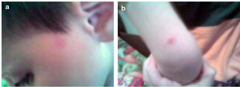
Figure 1 Skin manifestations of TMEP in our patient's: face (a) and limbs (b and c).

complaints. Psoralen plus ultraviolet A (PUVA) may be of benefit but its use on both adults and children is usually reserved for those with severe disease. 10 Other treatment options include systemic and local corticosteroids as well as topical, intralesional and systemic interferon. Nevertheless TMEP generally tends to be persistent and unresponsive to treatment.