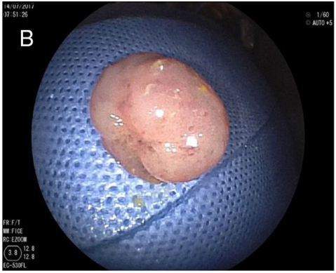
Figure 1 (A) Colonoscopic view of the lesion before the resection. Polypoid mass located on the Ileocecal valve. (B) 20-mm subpediculated polyp extracted.