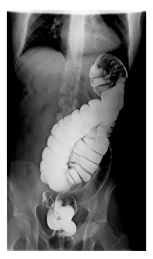
Figure 3 Barium enema showing the large bowel on the left side of the abdomen.

examination and blood tests were normal. A CT-scan (Figs. 1 and 2) and barium studies (Fig. 3) were performed, revealing location of the large bowel on the left side of the abdomen, a right-sided small intestine and abnormalities in the disposition of vascular structures.