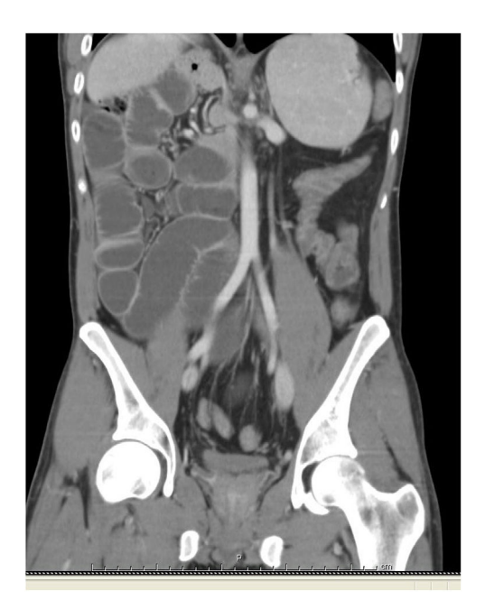
Figure 2 Coronal CT-scan showing abnormal location of the large bowel on the left side of the abdomen and a right-sided small intestine, without signs of bowel strangulation.

A 34-years-old man consulted for recurrent abdominal pain for the past 14 years. Abdominal ultrasound, upper endoscopy up to the second duodenal portion, celiac disease and Helicobacter pylori exams displayed normal results. He was admitted to our emergency department with a new flare of mesogastric pain which worsened with meals and was easily controlled with conventional analgesia. Physical