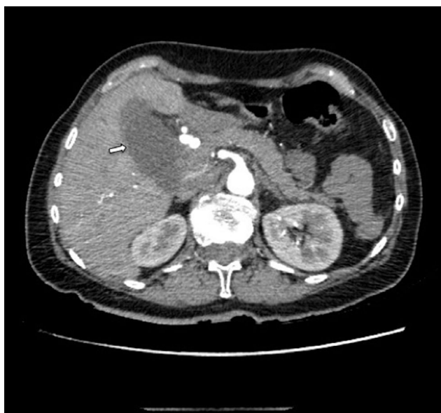
Figure 1 Abdominal CT scan showing a collection at the gallbladder bed (arrow).

Most of the subvesicular bile ducts belong to biliary system of the right hepatic lobe, and are small (1–2 cm in diameter). According to the Strasberg classification, it corresponds to a type A injury.