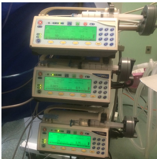
Figure 2 Piston-type pumps for sedoanalgesia perfusion.

0.002–0.005 \mu\text{g}/\text{kg}/\text{min} response dose; Propofol 1 mg/kg bolus for 3–5 min and then perfusion of 60–120 \mu\text{g}/\text{kg}/\text{min} to keep the BIS in the range of 60–75% (Fig. 2).