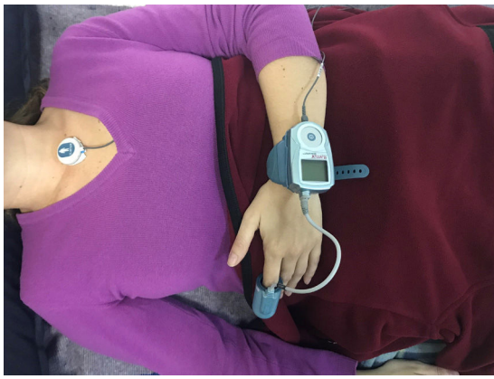
Figure 1 WatchPAT® device.

subjects were seen in outpatient clinic due to cardiovascular conditions such as uncontrolled or predominantly nocturnal arterial hypertension, recurrent palpitations with or without documented cardiac arrhythmias (mainly atrial fibrillation), or having undergone radiofrequency ablation of atrial flutter and/or atrial fibrillation with recurrence or paroxysms.