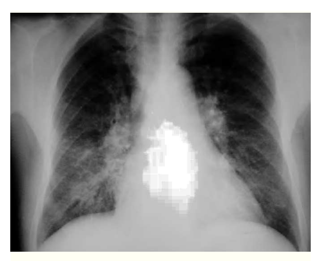
Figure 1.—Bilateral reticulary infiltrates at the lower zones on CXR.

Although there is an increasing interest to formaldehyde exposure because of its' high levels in occupational settings, occupational asthma occurs in sporadic cases. There is a latent period, which extends from weeks to years before symptoms begin. Reactions are then provocated by concentrations that