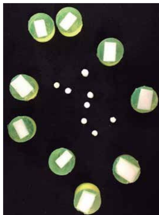
Figure 5. Ketac Cem, 3M™ ESPE™ glass ionomer.