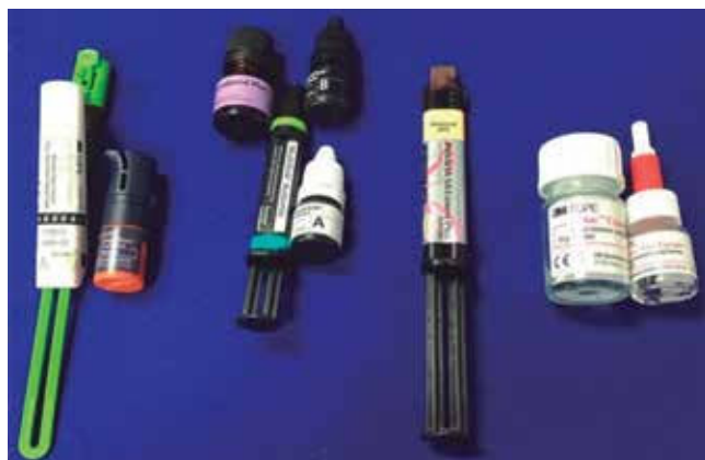
Figure 2. Cements used in the study.

Forty 7 x 7 mm square samples of Zirconia Lava™ Plus, 3M™ ESPE™ were obtained. They were sintered at 1,450 °C for 8 hours, according to manufacturer's instructions in an oven program S1P1600, Ivoclar Vivadent.