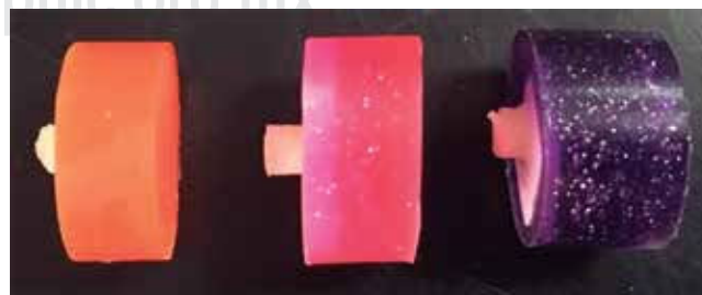
Figure 3. Samples of all three resin cements.

Ketac Cem (3M™ ESPE™) glass ionomer samples were discarded, since during manufacturing, all 10 samples failed ( Figure 5 ).