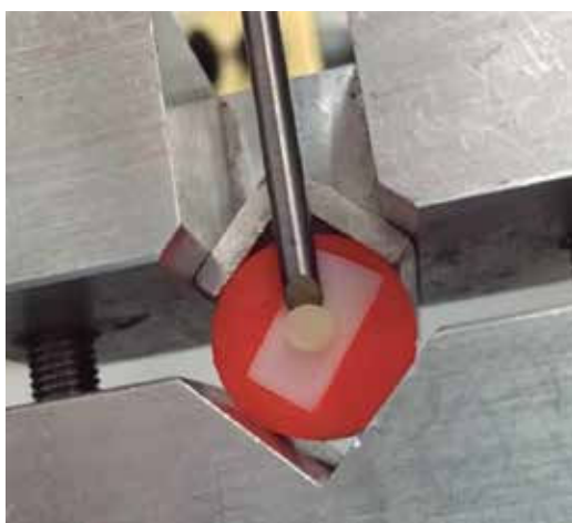
Figure 4. Shear test in the universal mechanical test appliance Instron® model 5567 USA.

Bonding agents have been developed in recent years. They have been introduced to improve bonding strength of ceramic to zirconium. When using RelyX® Elite and Multilink® Automix, the manufacturer recommends, in an alternative manner, to use systems with imprints or bonding agent Single