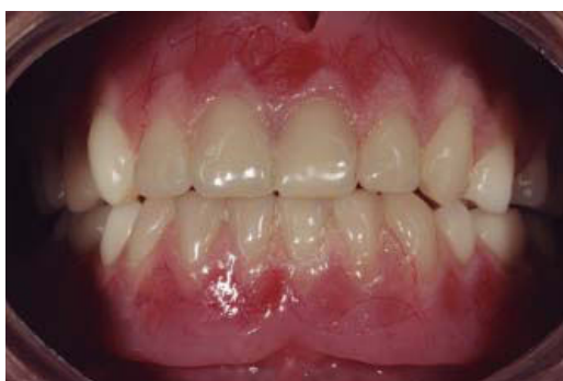
Figure 7. Front view of the female's prosthesis.

since patients begin their prosthetic treatment at very early ages, thus requiring a multi-disciplinary approach. Restoration of natural appearance is of the utmost importance in the psychosocial development of the patient as well as his future insertion in society. With respect to prosthetic treatment, full prosthetics is the most commonly used, notwithstanding the disadvantages encountered with the growth and development of the jaws, which causes maladjustment, and therefore, the need to undertake continuous changes in the dentures. Another disadvantage is patient cooperation; in these instances, parental help is of the utmost importance for the patient to accept treatment and constant use of dentures.