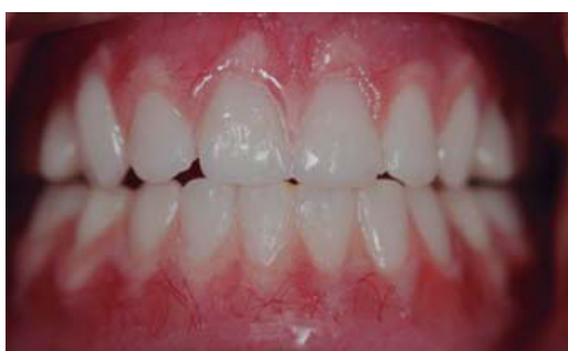
Figure 6. Intraoral view of the male's denture.