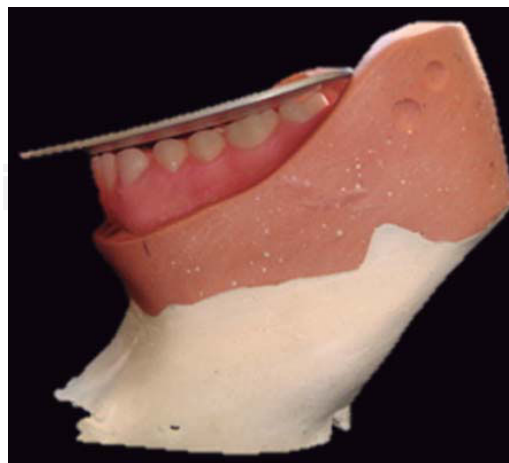
Figure 4. Placement of lower teeth using curved template.