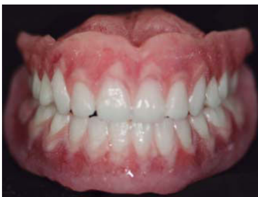
Figure 5. One of the processed dentures where characterization can be observed.

Dental treatment of hypohidrotic ectodermal dysplasia is complex. It entails special treatment,