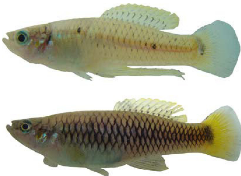
Figure 2. Heterandria anzuetoi (LSUMZ 15119) male (top) and female (lower) captured in the Paso Hondo River, Lempa River basin, Department of Cabañas, El Salvador, 2011.