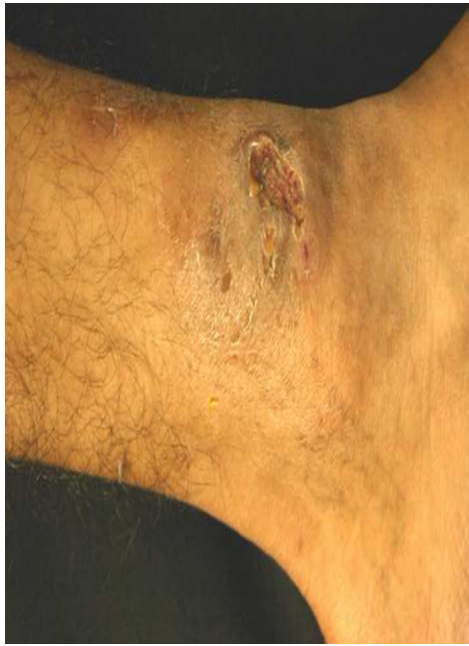
Fig. 1. Multiple subcutaneous nodules surrounding an irregularly shaped ulcer.

We report the case of a 25-year-old, Mexican male with subcutaneous phaeohyphomycosis due to Curvularia lunata . He is dedicated to agriculture in the Southeast of Mexico, an area of tropical climate.