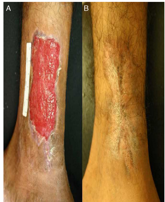
Fig. 3. (A) View after surgical resection. (B) Complete healing after 8 months.

With the aid of hydrocolloid and alginate dressings, the wound healed in 4 months but the patient was kept on itraconazole for a total of 8 months (Fig. 3b). He has been followed for over two years without recurrence.