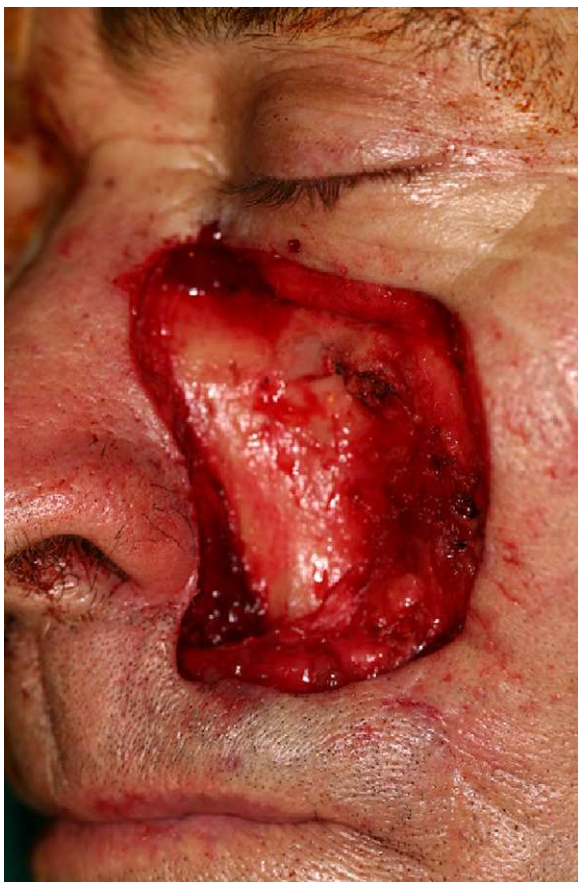
Fig. 4 – Surgical bed with adequate safety margins.

This report tries to make a special emphasis concerning a proper management of eccrine spiradenoma, frequently benign, but, as in our case and due to an incorrect initial