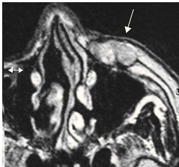
Fig. 2 – Facial MRI showing the lesion (white arrow).

Eight months later, the patient presented a recurrence on the cervicopectoral scar, near the lips. According to this, a new resection was performed again obtaining histological free margins (Fig. 4).