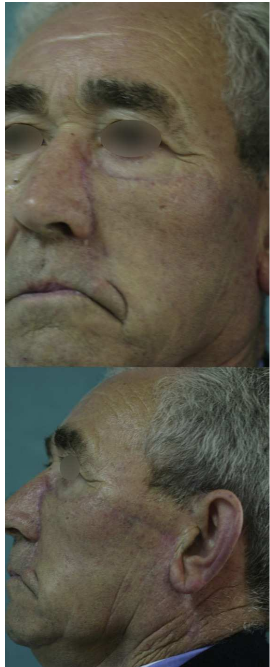
Fig. 5 – Postoperative aspect of the patient from lateral and frontal view. Notice the good aesthetic result.

management, sometimes malignant. Since Kersting and Helwig first described the case in 1956, 9 and Beekley et al., 7 reported its malignant transformation in 1971, only a few cases can be found in the literature. 2-6,8-10