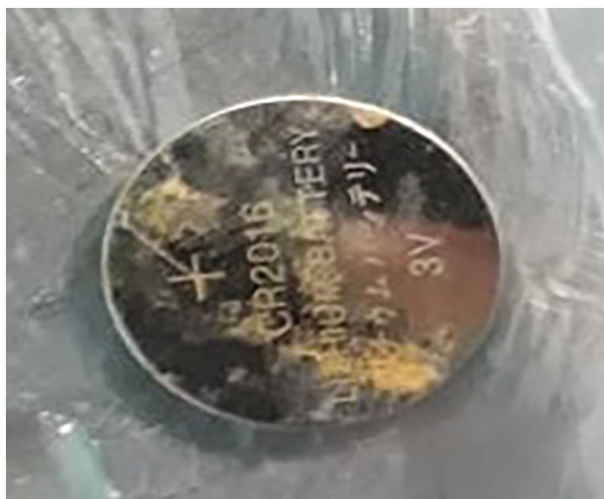
Figure 1B. Button battery extracted.