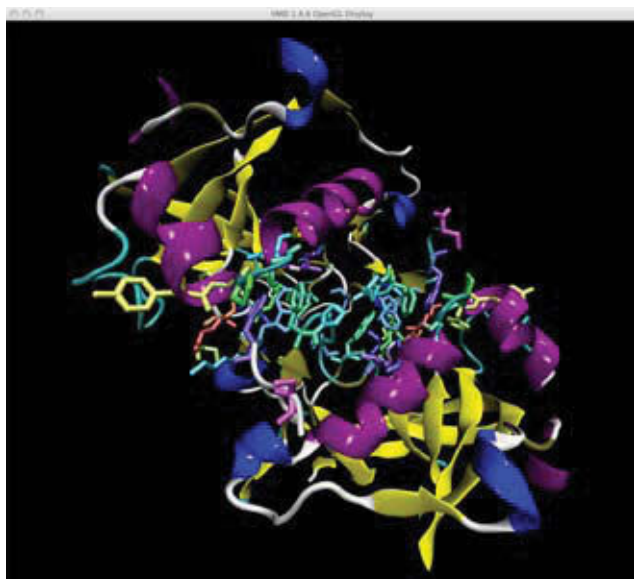
Figure 1. OpenGL window of the protein under display. Notice how the backbone cartoons have been sliced both at the front and the back of the structure. The slice width is \pm 18 Å from the interface (as indicated by the widget in Figure 2), but it can be changed at will from 5 (only the interface side chains are shown) to 50 Å (full view).