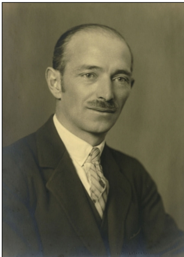
Figure 4 John Arnold Cranston (1891–1972).

It appears to the author that no more promising step in this direction could be taken then by ruthlessly cutting out the historical approach to the subject. The study then becomes a rational one. The physicist's atom is taken as the starting point and a reasonably detailed picture of its structure is drawn. The fundamental laws of chemistry, the concepts of valency, the reactivities of the various elements, and the ionic hypothesis, then tumble out of the picture in a perfectly rational way. Armed with these concepts, plus the purely mechanical one embodied in the law of mass action, the student is then very well equipped to tackle the factual aspect of chemistry. The whole study has become integrated.