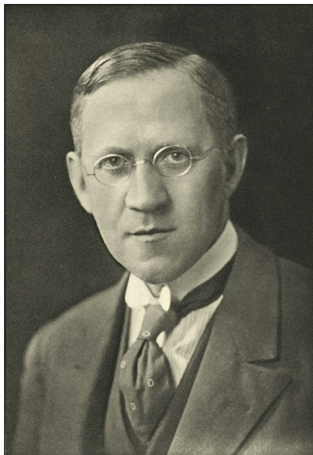
Figure 2 Thomas Martin Lowry (1874–1936).

Lowry's secondary education was obtained at Kingswood School in Bath, a Methodist boarding school founded by John Wesley in 1748. In 1893 he entered the Central Technical College of the City and Guilds Institute in South Kensington and, upon graduation in 1896, became an assistant there to the iconoclastic organic chemist, Henry Armstrong, leading to a D.Sc. degree granted by the University of London in 1899. While working with Armstrong, Lowry simultaneously served, from 1904 on, as a Lecturer in Chemistry at the Westminster Training College, which specialized in the education of teachers for Methodist schools. These associations ended in 1913 when he was appointed head of the chemical department at Guy's Hospital Medical School and as a Professor of Chemistry at the University of London. Finally, in 1920 he was appointed to the newly established chair of Physical Chemistry at Cambridge University, where he remained until his untimely death on 02 November 1936 at age 62.