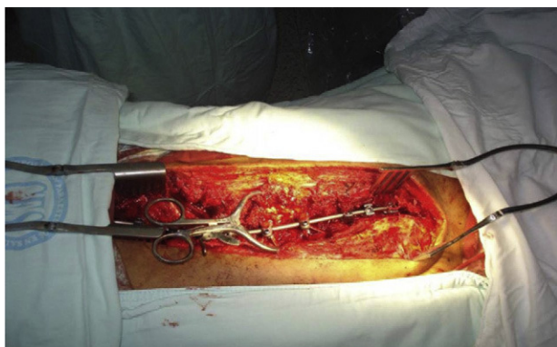
Fig. 3 – Instrumentation with pedicle screws from T3 to L3 in a single bar system.

Normal volumen hemodilution was carried out once again with colloids at a 1:1 rate, a 900 ml phlebotomy, a 1 g tranexamic acid bolus and a 10 mg/kg/h infusion. Desmopressin was administered at a 0.3 µg/kg single dose, monitoring and maintenance resembling the first surgery. Later into the procedure, thoracoplasty was carried out by resecting five rib segments from the hunch on the convex side of the deformity. Cosmetic improvement was satisfactory and the movement of the more displaced segments of the column was eased, which will later improve the patient's thoracic expansion capacity. Next, concavity instrumentation with pedicle screws was carried out from T3 up to L3 in single bar system. Implants and two polyester flanges were placed on the curve's apex sheets. The rib fragments were then used as an autologous graft. The estimated bleeding volume was 2200 ml (Fig. 3). When the procedure was finished, the patient remained under intubation and was moved again to the ICU. He presented severe bronchospasm as an early complication and thus required further mechanical ventilation.