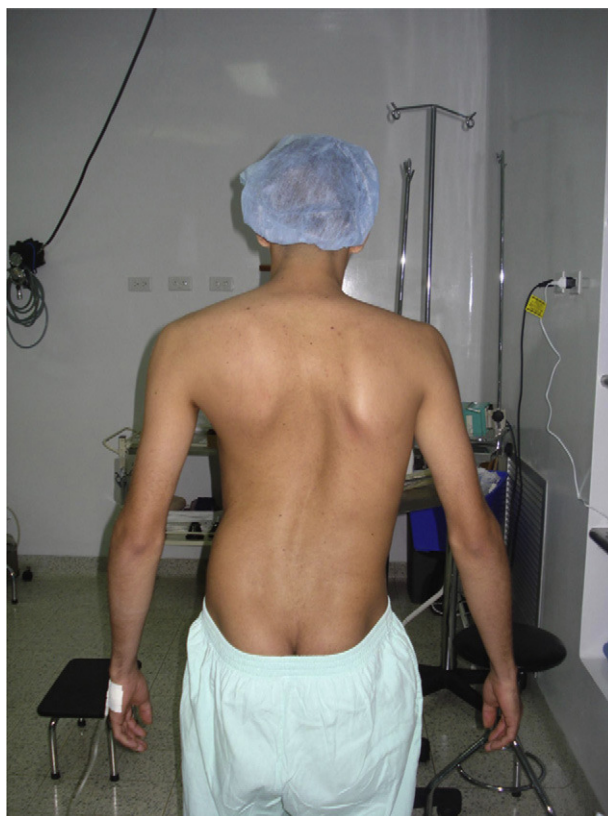
Fig. 1 – Image of the patient prior to the first surgery.