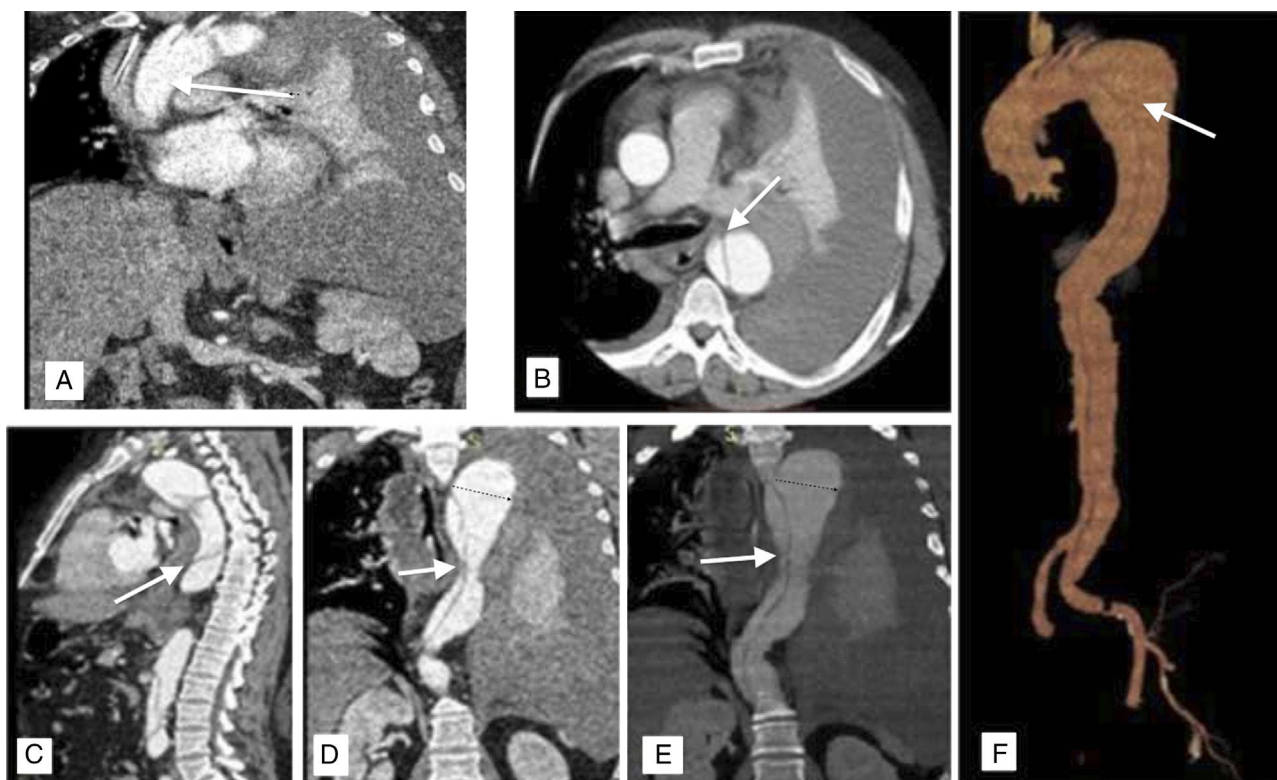
Figure 2 (A and B) Chest CT sagittal and axial scans showing aneurysmal dilatation with extravasation area, left pleural effusion. (C–E) Sagittal and coronal section showing double lumen from descending aorta to common iliac. (F) Digital reconstruction of aorta.

and negative troponin. The patient developed cardiogenic shock and death. 4–7 Acute aortic syndrome should be identified early by clinical suspicion and supported by diagnostic studies to provide timely treatment because of its high mortality rate. Diagnostic imaging studies in clinical suspicion of dissection play an important role, such as confirmation of clinical suspicion, classification of dissection, localization of tears, assessment of extent of dissection and indicators of urgency. 8