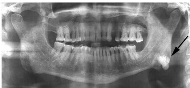
Fig. 1 – Dental panoramic tomography showing a radiopaque well-defined image at the left mandibular angle.

A Computed Tomography was performed with a HiSpeed NX-I Dual Slice (General Electrics Dentscan, General Electrics Healthcare, United Kingdom; Dentscan). Axial slices