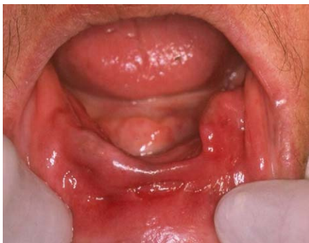
Figure 2 – Clinical presentation of a lower epulis fissuratum without prostheses.

(Figs. 1-3). She was using upper and lower complete prostheses both badly adapted. There were no cervical or submandibular adenopathy. Epulis fissuratum presumptive diagnoses were made. Complete blood count, coagulation tests and general biochemistry were within normal values with an INR of 2.1. She had not stopped her habitual medication for surgery. These lesions were treated under local anesthesia with carbon dioxide laser (DEKA™ Smart US 20D), pulse mode, 0.9 mm focus, 5-6W power (Figs. 4-7), focalizing the beam for mucosal cut and defocalizing when tissue vaporization was required. 10 Usual safety precautions of protecting the operator, patient,