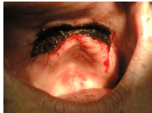
Figure 5 – Aspect of surgical wound after carbonization to ensure haemostasis.

and assistant were followed. Only the site of surgery was exposed; all other areas were protected with wet gauze. Additionally to epulis removal we perform a partial vestibuloplasty. No suturing was used and the wound was allowed to repair by second intention. Excised tissues were submitted for routine histological examination on 10% formalin solution with indication of a CO2 laser excision. Appropriate new prosthetic rehabilitation was provided. After 3 weeks, wound healing was completed uneventfully (Figs. 8 and 9). In maxillary sulcus a 3-mm depth extension was gained, increasing the prosthesis