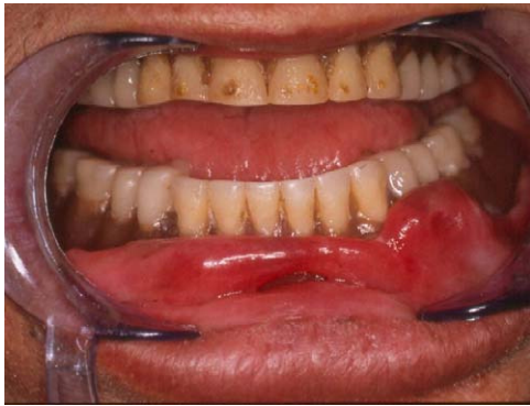
Figure 1 – Clinical presentation of a lower epulis fissuratum with prostheses.