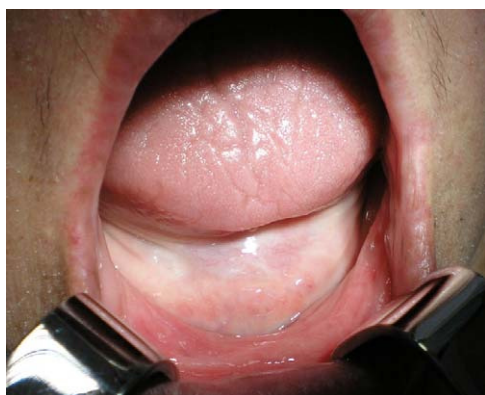
Figure 8 – Clinical aspect 3 weeks after surgery.