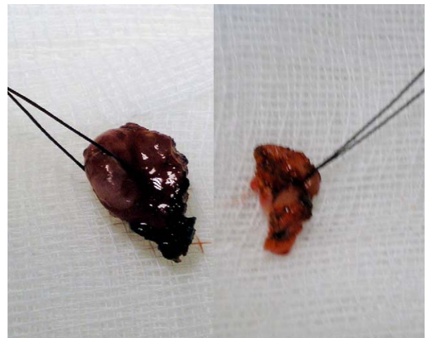
Figure 6 – Operatory product of maxillary epulis excision.

and assistant were followed. Only the site of surgery was exposed; all other areas were protected with wet gauze. Additionally to epulis removal we perform a partial vestibuloplasty. No suturing was used and the wound was allowed to repair by second intention. Excised tissues were submitted for routine histological examination on 10% formalin solution with indication of a CO2 laser excision. Appropriate new prosthetic rehabilitation was provided. After 3 weeks, wound healing was completed uneventfully (Figs. 8 and 9). In maxillary sulcus a 3-mm depth extension was gained, increasing the prosthesis