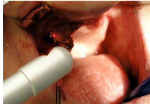
Figure 4 – Excision of epulis fissuratum with CO2 laser.