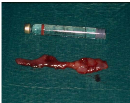
Figure 7 – Operatory product of mandibular epulis excision.