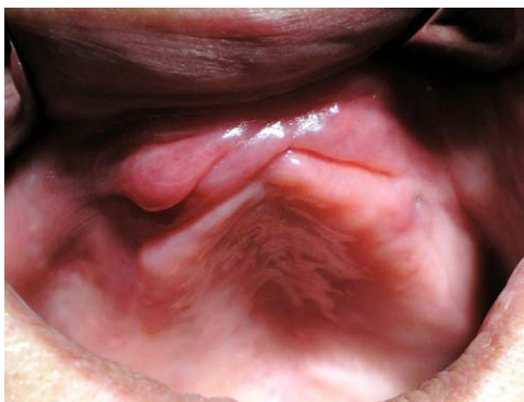
Figure 3 – Clinical presentation of an upper epulis fissuratum without prostheses.

(Figs. 1-3). She was using upper and lower complete prostheses both badly adapted. There were no cervical or submandibular adenopathy. Epulis fissuratum presumptive diagnoses were made. Complete blood count, coagulation tests and general biochemistry were within normal values with an INR of 2.1. She had not stopped her habitual medication for surgery. These lesions were treated under local anesthesia with carbon dioxide laser (DEKA™ Smart US 20D), pulse mode, 0.9 mm focus, 5-6W power (Figs. 4-7), focalizing the beam for mucosal cut and defocalizing when tissue vaporization was required. 10 Usual safety precautions of protecting the operator, patient,