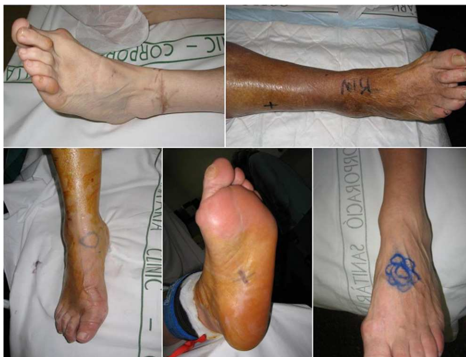
Figure 2 Various images of marks made by the patients.

lipstick, another patient drew an ankle bracelet with a felt-tip pen, another made a round mark on the back of the foot, one relative had written the patient's name with a felt-tip pen and another patient had made a mark in the form of a cross with sticking plaster (Fig. 2).