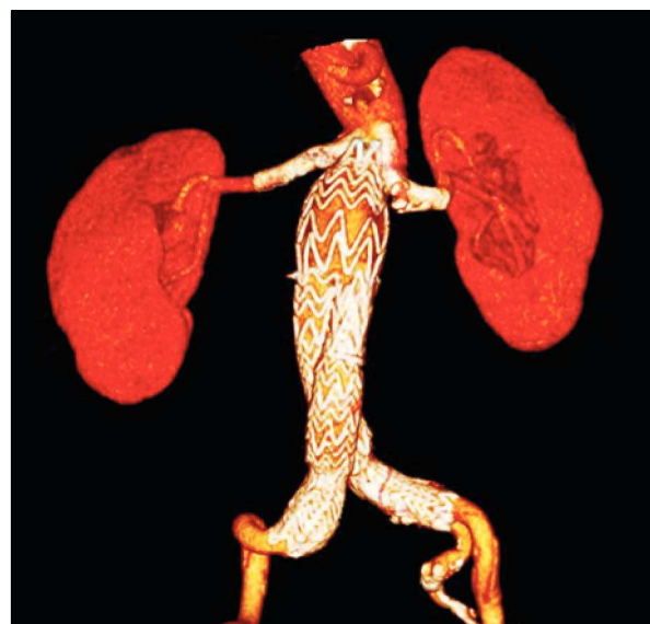
Figure 2 – CT angiography of the abdominal aorta with 3-D volumetric reconstruction of the treated aortoiliac segment, performed postoperatively (30 days).