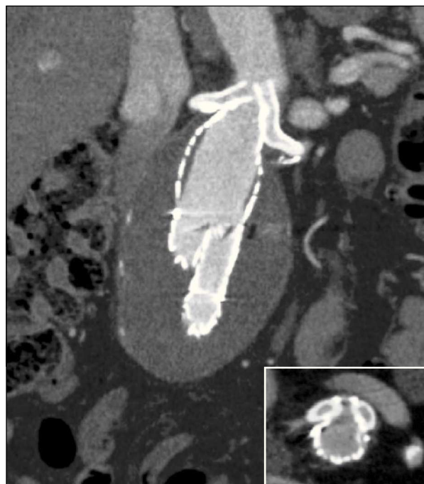
Figure 3 – CT angiography of the abdominal aorta in coronal section, showing adequate coupling between the endoprosthesis and the coated stent. Patent renal arteries. In the detail, axial section showing absence of leaks.

The procedure was performed through dissection of the bilateral common femoral artery and puncture of the bilateral brachial artery, with the introduction of a long 8F sheath in the abdominal aorta. The renal arteries were catheterized through brachial access and 0.035 extra-stiff guidewires were positioned; then, the 5 × 50 mm Viabahn coated stents (WL Gore & Associates – Flagstaff, USA) were released. The Excluder® aorta endoprosthesis (WL Gore & Associates, Flagstaff, USA) was positioned through the femoral artery above the anatomical origin of the renal arteries and below the proximal portion of the coated stents (Figure 1).