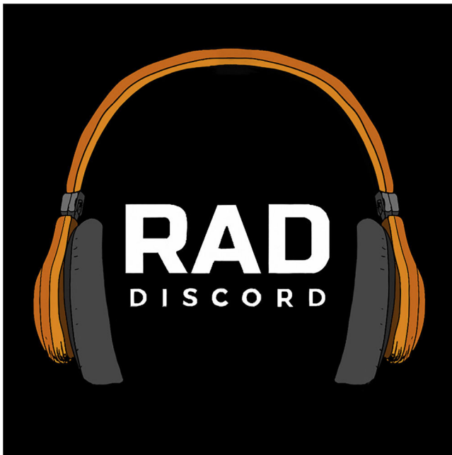
Figure 4 RadDiscord. Server for the Discord platform, whose creation was a direct consequence of the COVID-19 pandemic as an aid for final-exam preparation in the speciality of radiology, and which has become a true online international radiology community ( https://www.raddiscord.org/ ).