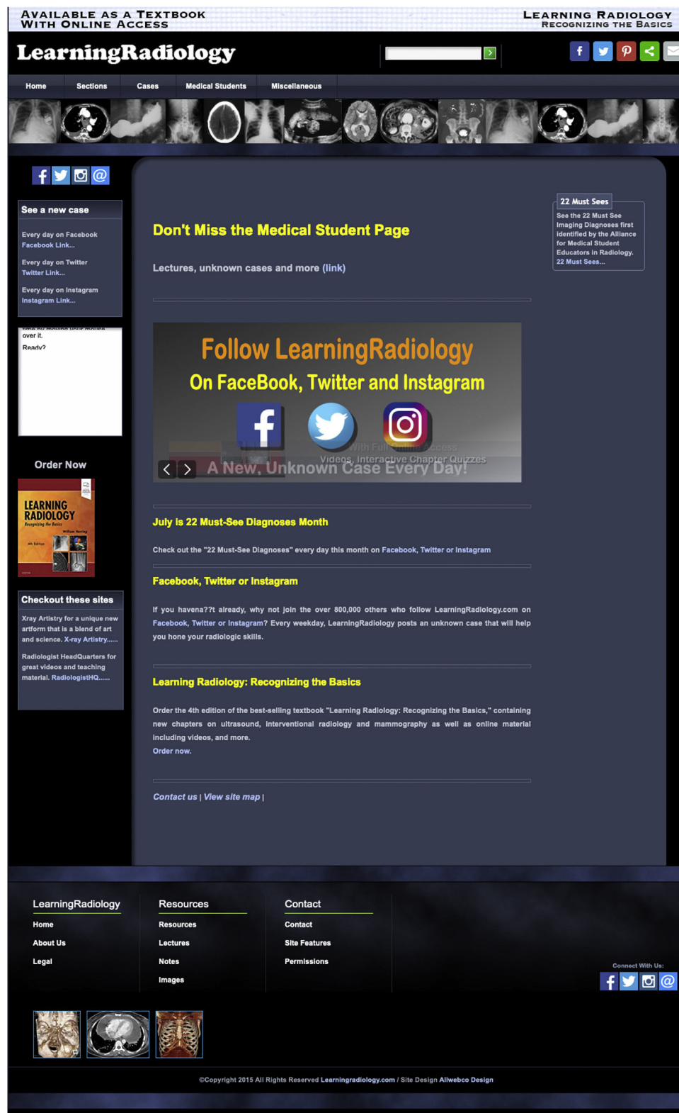
Figure 2 LearningRadiology. Website designed and maintained by Dr William Herring, from the Einstein Medical Center in Philadelphia (United States), which was created with the aim of replacing the paper notes that accompanied the lectures for medical residents and medical students ( http://learningradiology.com/index.htm ).