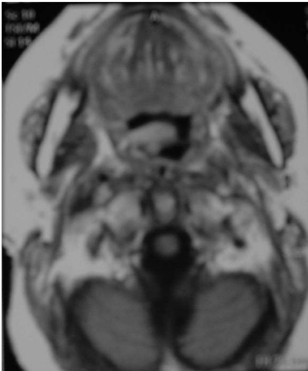
Figure 1 The MRI shows a hypervascularised and hypertrophied uvula.

The examination revealed a polypoid tumour affecting the uvula. The MRI showed a vascular lesion limited to the uvula, without enlarged lymph nodes (Fig. 1).