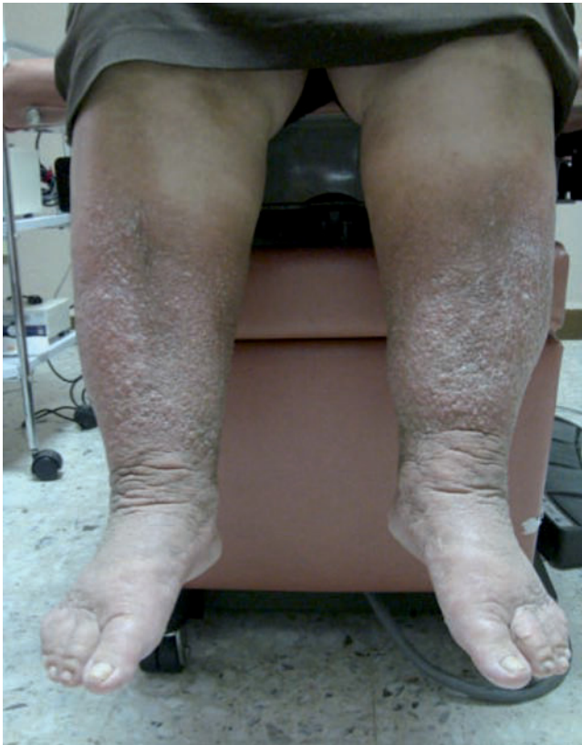
Figure 4 Late-onset primary lymphedema of both lower extremities with the presence of chronic skin changes in a patient of 62 years.

tion, murals (pericytes), cellular proliferation and migration and the specification of blood vessels, venous or lymphatic. 33