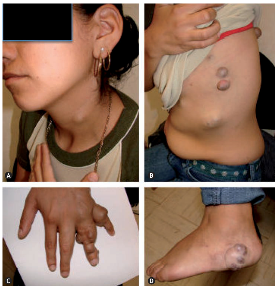
Figure 2 Maffucci syndrome. A: venous malformation (VM) on the lateral side of the neck. B: VM cysts, clustered in the anterior, lateral and posterior of the thorax. C: VM depressible, bluish, in the form of grape bunches which empty upon raising the hand and enchondroma in the phalanges. D: VM on the external side of the left heel.

blood vessels, epithelial connective tissue and neural skin elements, which suggest the existence of somatic mutation in the implicated area. 32 On the other hand, precapillary sphincters in charge of regulating blood flow may have an