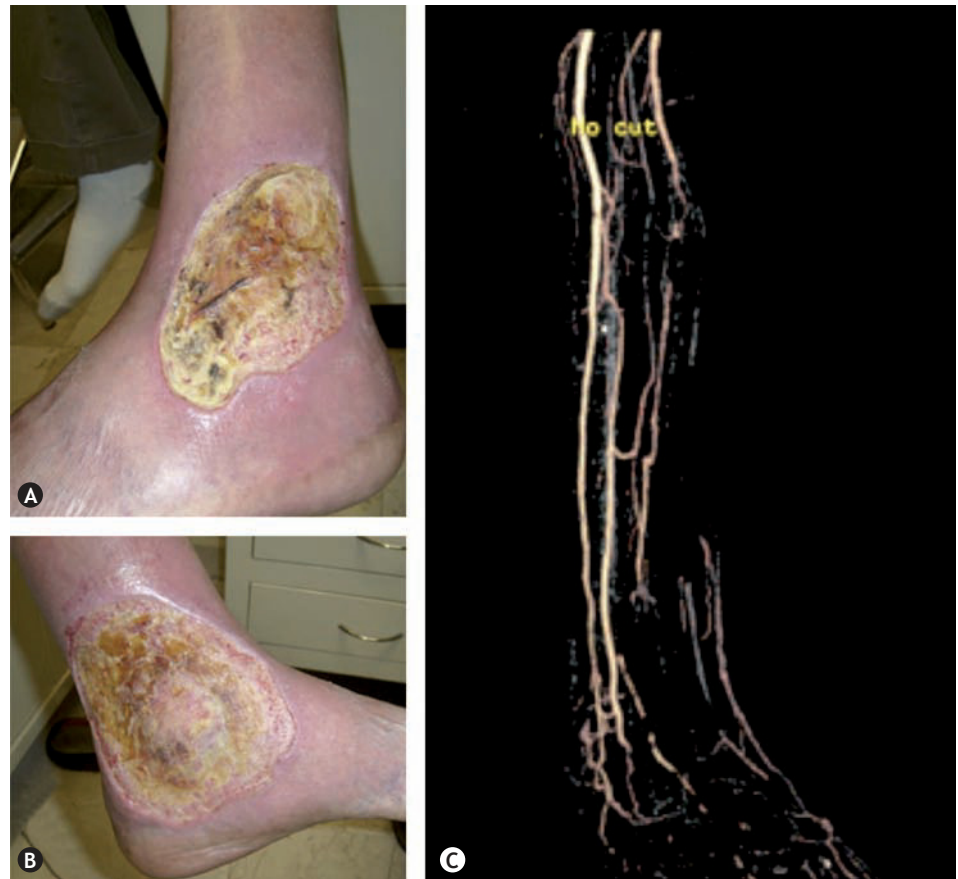
Figure 5 Arterio-venous malformation in a patient of 57 years which caused ulcers in the lower left extremity in the external malleolar (A) and medial (B) region which was accompanied by refractory pain to medical treatment and the diagnosis of AVM was confirmed by ultrasound and angio-MR (C).

sented in a unilateral way, provoking a mass effect causing distortion and asymmetry of facial structures. 44 When they affect the tongue, palate and oropharynx they result in a significant deformity, causing dental malocclusion and if it invades airways it can cause life-threatening lesions. 45 Any part of the digestive tract may be implicated, it can be presented as nodular, sessile or polypoid lesions which provoke chronic bleeding. In troncular venous lesions which manifest as venous dilation or real aneurysms, there is a thrombophilic risk, therefore the presence of venous thrombosis and pulmonary embolism is common. 46,47