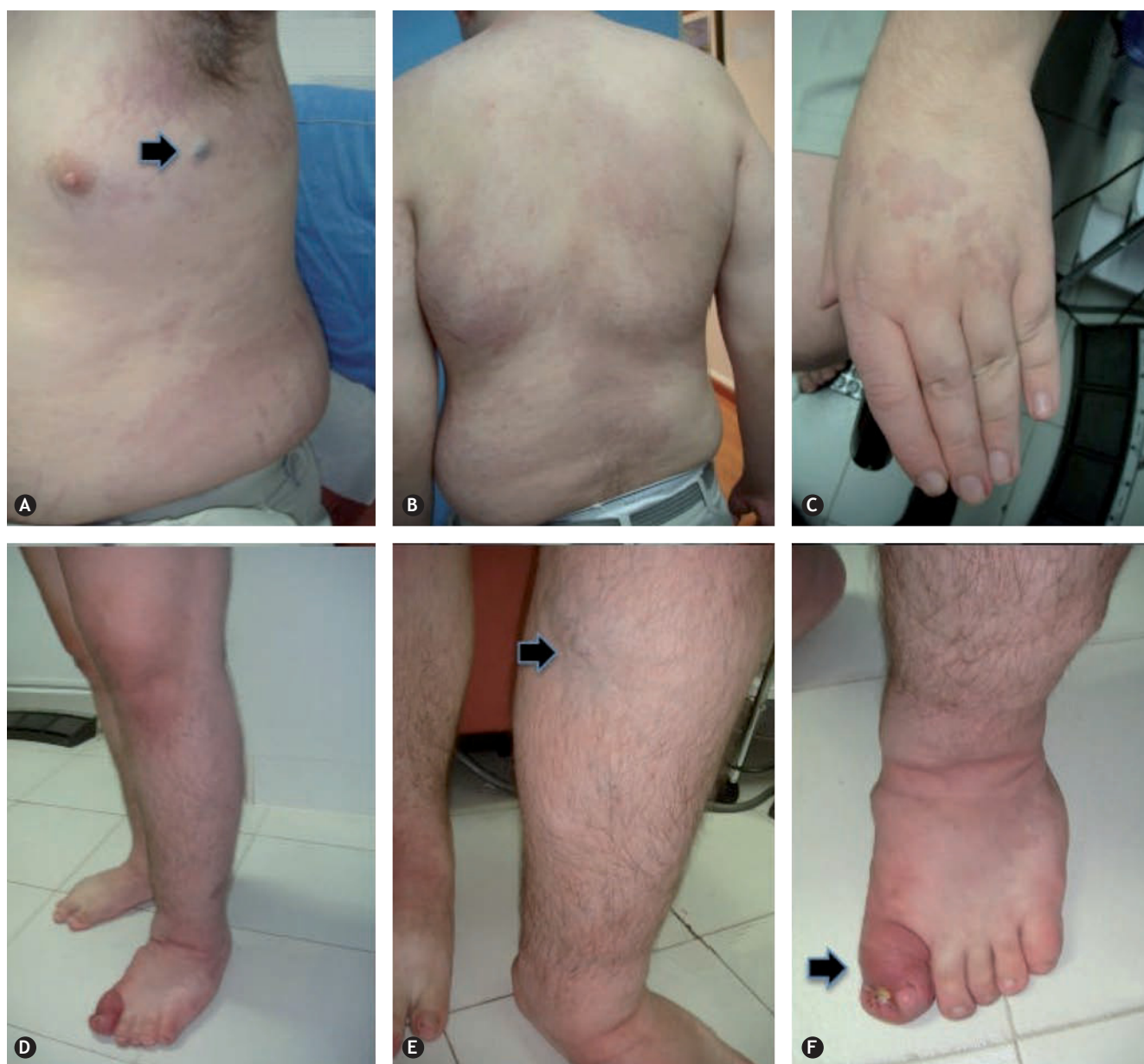
Figure 1 Klippel-Trenaunay syndrome. A: capillary malformation (port-wine stain: diffuse, irregular borders and dim color) on the lateral face of the thorax and abdomen, lymphatic cyst on the axillary region. B: scoliosis and capillary malformation on the back of the chest and abdomen. C: increase in the volume of the fingers secondary to lymphedema. D: hypertrophy and lymphedema of the lower extremities. E: venous malformation in the medial aspect of the upper third of the left leg. F: acute complication of lymphedema: onicocriptosis and cellulitis of the first toe.

Troncular lesions are formed in the late embryonic stage where vascular trunks are being formed, 13 and at the same time are subdivided into obstructive and/or dilated lesions (figure 1). Cells forming this type of lesion have lost the ability to proliferate and are presented as a remnant of fetal vasculature, being displayed as aplastic, hypoplastic, or