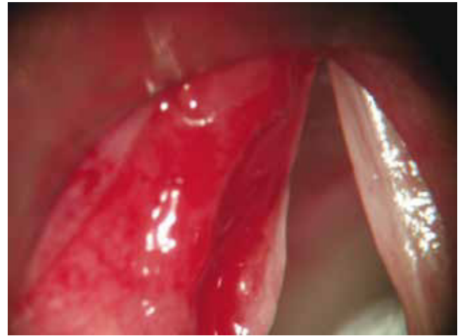
Figure 7 Patient 4, post-surgery. No evidence of lesions at the supraglottic or glottic level.

The same surgical procedure was executed, and we sent a sample for histopathological analysis. Post-surgical data: Maximum phonation time of 21 seconds, glottic force closure rate index of 4, reflux index of 2, quality of life index of 5 (Fig. 7).