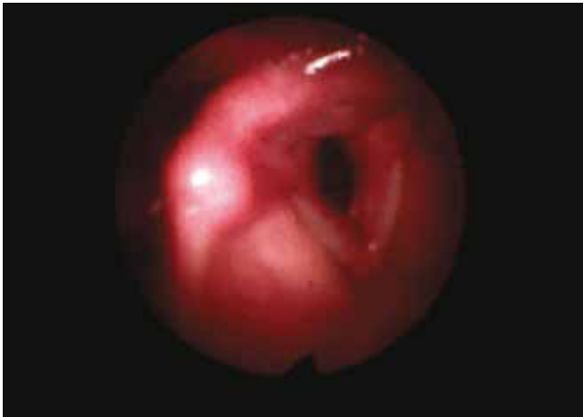
Figure 2 Patient 2, first visit. An increase in volume is observed in the left lower lip of the true vocal cord, creating premature contact upon glottal closure.

was 7 seconds, S:Z ratio of 5:3. We were able to observe a major glottis edema with the videolaryngoscopy (Fig. 2). A phonomicrosurgery with cold technique was performed, and the sample was sent for histopathological analysis with an amyloidosis report.