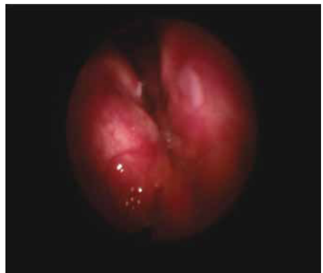
Figure 1 Patient 1, first visit. An increase in submucous volume can be observed in the photograph, altering the anatomy of the false vocal cords at the supraglottic level.

Her glottic closure force index was 12, reflux index of 17 and quality of life index of 7. Her maximum phonation time