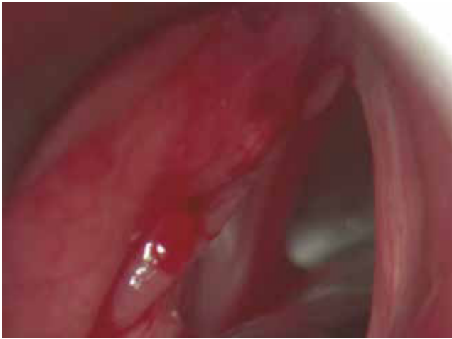
Figure 6 Patient 4, first visit. Submucous lesions at the left false vocal cord level can be observed.