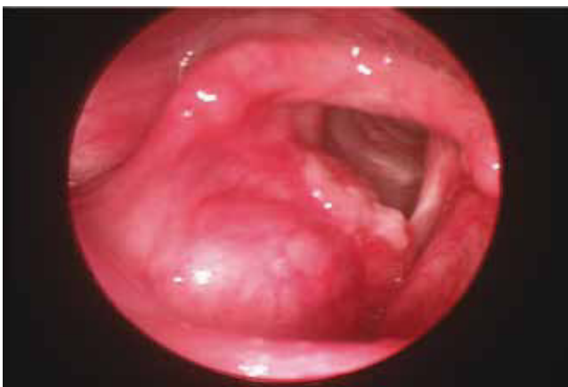
Figure 4 Patient 3, first visit. Increased exophytic volume can be seen, at the right level of the false vocal cords, which does not obstruct the glottic light. And a plain deformity of the right true vocal cord with premature contact and alteration of the chordal wave vibration.

At physical examination: Glottic leak, a glottic force closure rate index of 19, reflux index of 25, and a quality of life