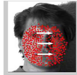
Figure 4. N number of points on the face from left to right.

Finally, mapping is applied between non-illumination parts to illumination part of the face. This step is usually the marking of facial feature points to compensate on illumination part. Basically, this final step is performed in a two-step process. Firstly, N face markers are applied to point marks on the face as depicted in Figure 4.