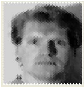
Figure 2. Convert 2D image to Hexagonal lattices.

where an original image f_s(m,n) represents square pixel image with M \times N rows and columns, f_h(x,y) is the preferred hexagonal image while h shows interpolation kernel for reconstruction method. Similarly (m, n) and (x, y) are the sample points of original square image and the desired hexagonal image respectively.