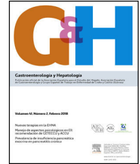
IMAGE OF THE MONTH