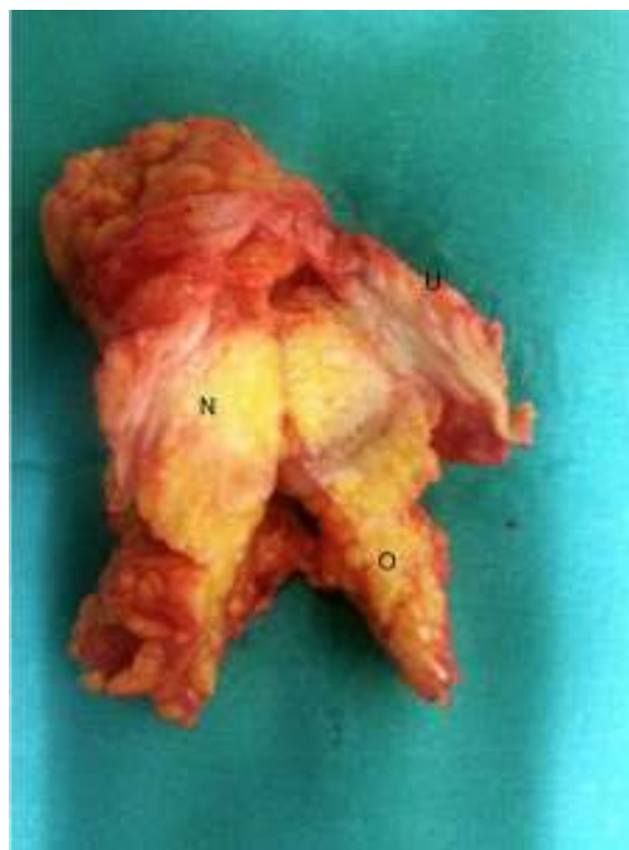
Figure 2 Surgical specimen. O, omentum; N, nodule; U, umbilicus.

SMJN varies in colour, and can be white, purplish or brownish. 1,9 The nodules are typically firm and irregular, located at dermal, subcutaneous or peritoneal level, and measuring 1–2 cm, although nodules of up to 10 cm have been described; they may be painful and occasionally itchy.