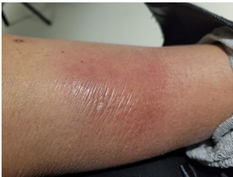
Fig. 1. Painful erythematous subcutaneous nodules on the patient's left leg.

d Unidade Local do Programa de Prevenção e Controlo das Infecções e da Resistência aos Antimicrobianos – Unidade Local de Saúde de Santa Maria, EPE/Hospital de Santa Maria, Lisboa, Portugal