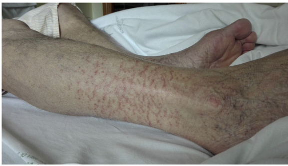
Fig. 2. Patient 2: Mild vasculitis lesions in distal legs after CCP transfusion.