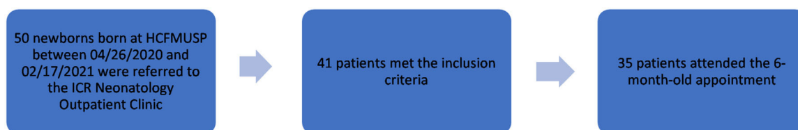
Fig. 1. Description of newborns in the period, those with inclusion criteria and those who appeared for evaluation by the Bayley III Screening Test.