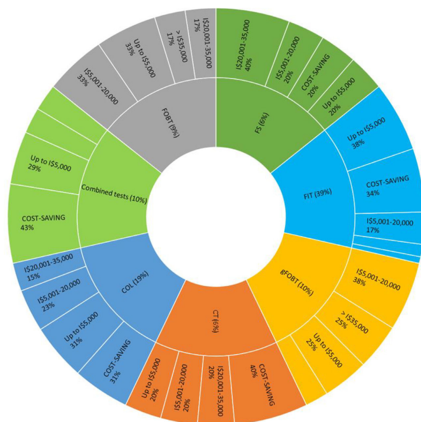
Fig. 2. Colorectal cancer screening Incremental Cost-Effectiveness Ratios (ICERs) results. COL, Colonoscopy; CT, Computed Tomography; FIT, Fecal Immunochemical Test; FOBT, Fecal Occult Blood Test; FS, Flexible Sigmoidoscopy; Combined tests (When more than one type of test was used). *All ICERs were adjusted by local inflation to 2020 and then converted in International dollars ($) using the Organization for Economic Co-operation and Development (OECD) Purchasing Power Parity conversion rates.

In addition, CRC screening was demonstrated to be cost-saving in 21% of economic evaluations, meaning that the screening program in the average-risk population would be more effective and less expensive