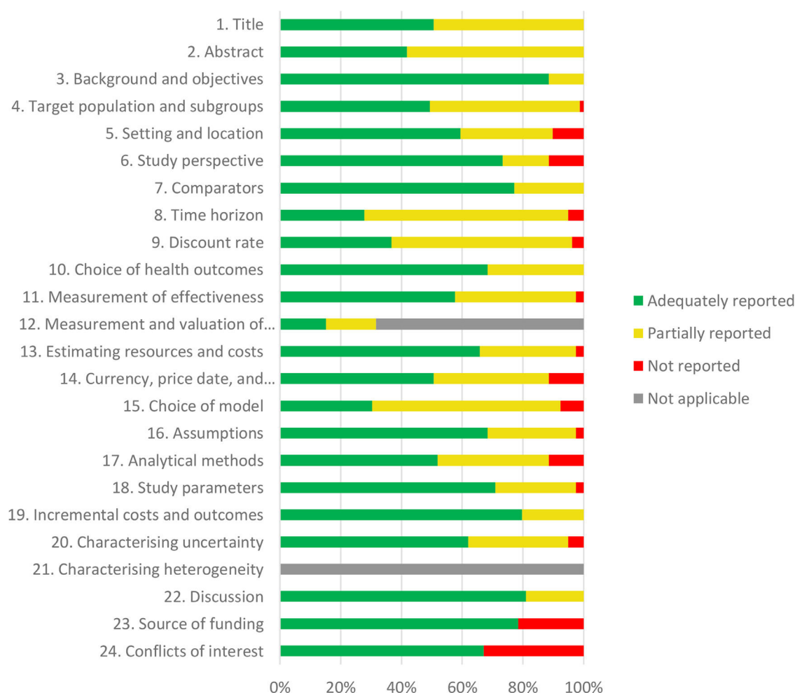
Fig. 3. Report quality assessment by CHEERS checklist of all included economic evaluations of CRC screening.

This systematic review comprehensively identified CRC screening economic evaluation studies in the average-risk population worldwide. In this research, the authors found 79 full economic evaluations on CCR screening in the average-risk population over 40 years old. The first publication's date was in 1991, and there was an increase in this research subject in subsequent decades. Indeed, it is well known that based on their effectiveness and cost-effectiveness, population-based programs