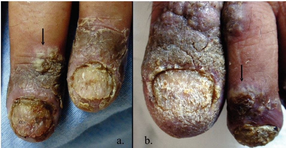
Figure 3 - a. verrucous paronychia with dystrophic finger nail b. similar aspect of the halux. Note the rest of some flacid bullae (arrows)