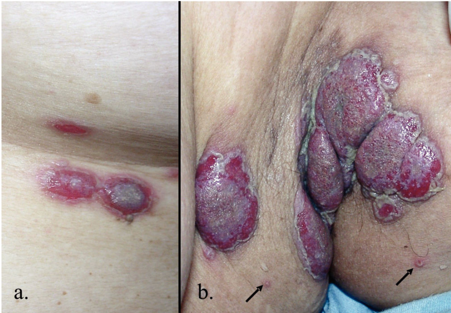
Figure 1 - a. vegetating plaques on the inframammary fold. b.similar lesions in the axillary fold with two small blisters (arrows)