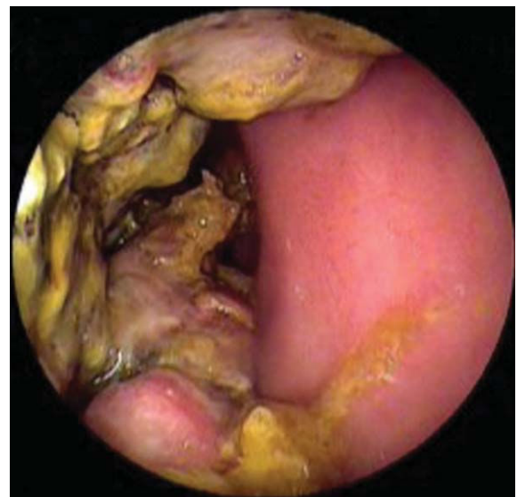
Figure 2. Primary adenocarcinoma of the duodenum